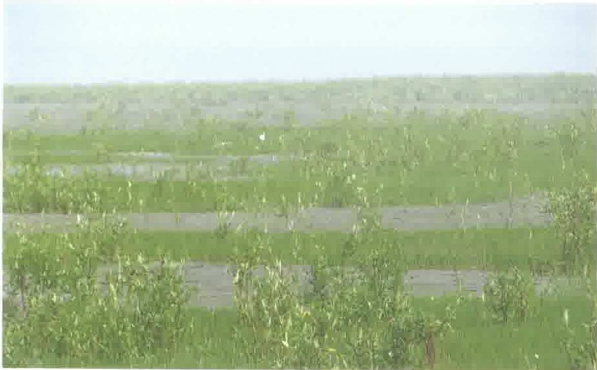
Mangroves planted in 100 ha. area at Ankalva Coast during 2010-11