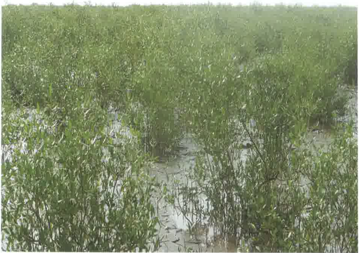
Mangroves planted in 50 ha. area at NADA Coast during 2009-10