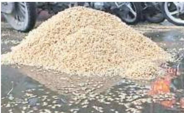
Farmers' produce is drenched at the Jasdan APMC.

tural crops in Rajkot, Amreli, Junagadh, Botad, Morbi, Bhavnagar and Jamnagar late Sunday. The storms continued on Monday as overcast skies gave way to hailstorms and rain.