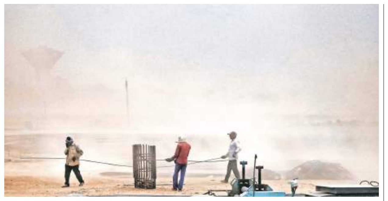
Workers in Ranip area negotiate a dust storm that hit Ahmedabad city on Monday.