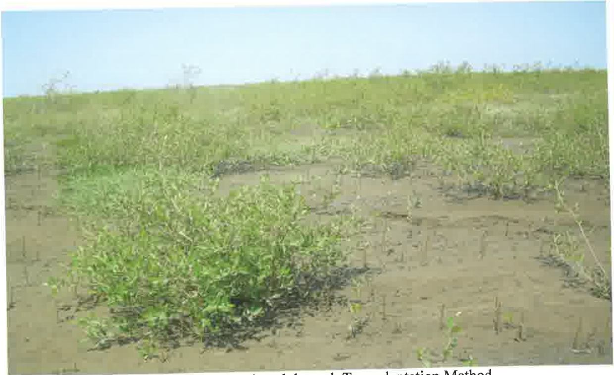
Mangroves developed through Transplantation Method Dahej, 2008-09 Status as on May 2012