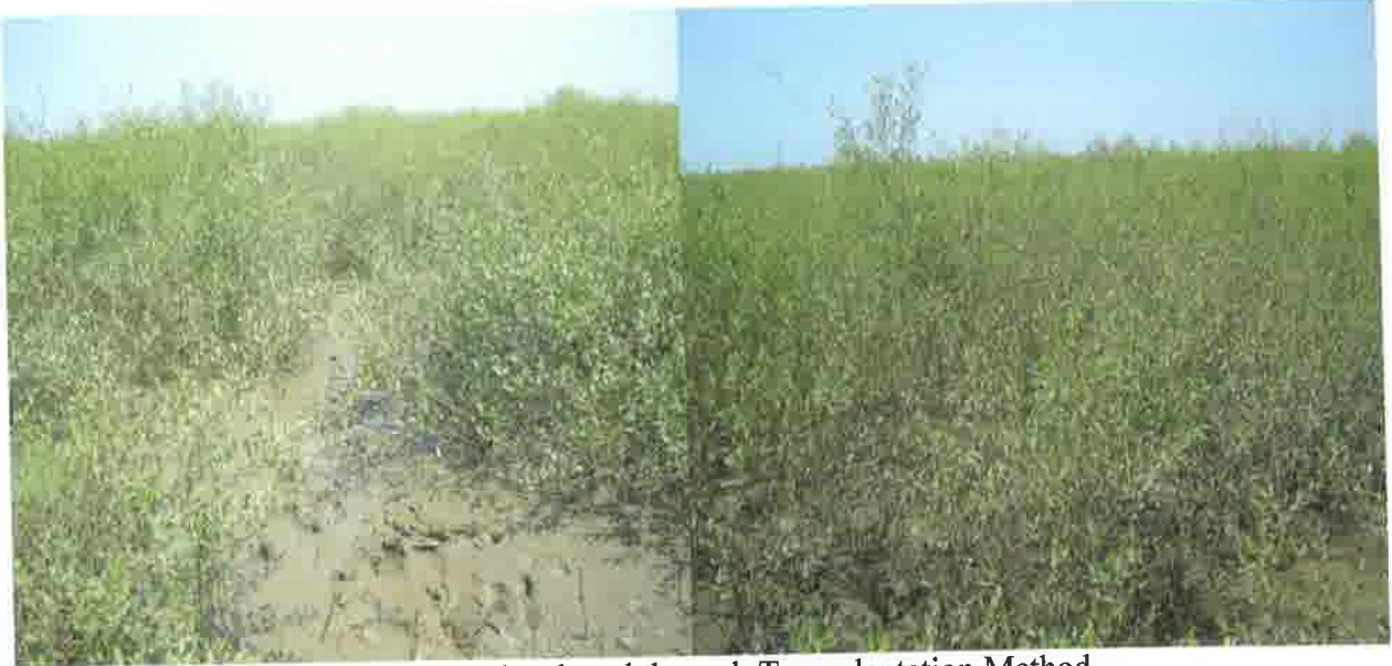
Mangroves developed through Transplantation Method Dahej, 2008-09 Status as on May 2012