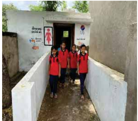
Closing Ceremony Swachhata Pakhwada – 2024