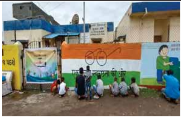
Swachhta Hi Seva - 2023