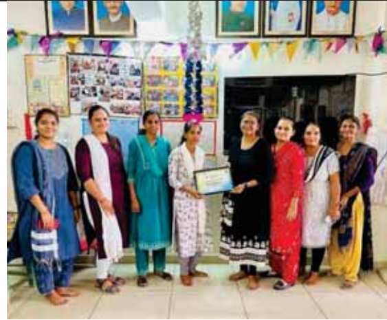
MOU Signed with Gujarat Commerce and Science Collage, Dahej