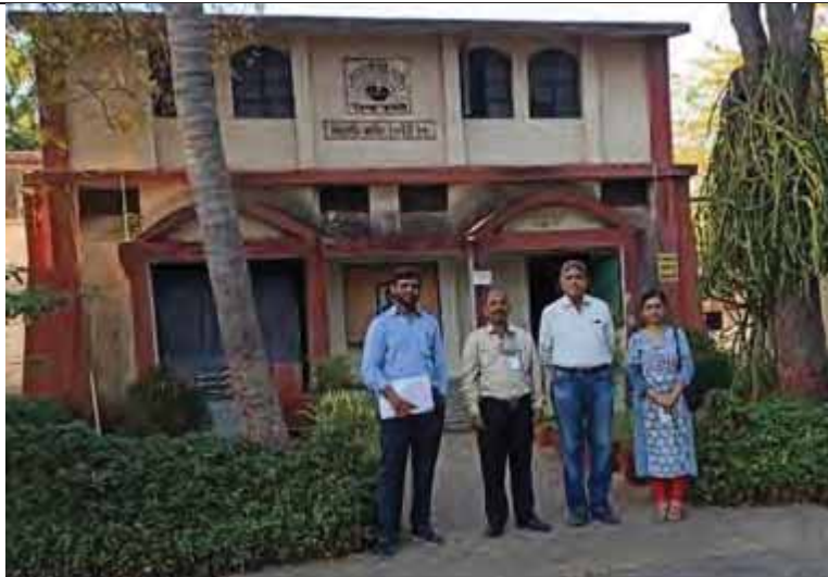
Distribution of 1000 Saarthi Assistive Devices to 1000 Blind persons in Gujarat State