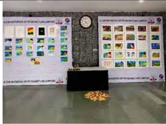
Har Ghar Tiranga Celebrations