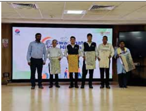
Support for Community Mass Marriage for Poor Families, Suva Village