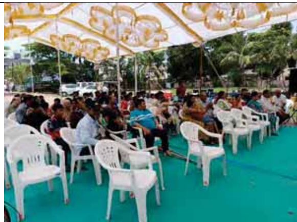
Swachhata Pakhwada - 2025