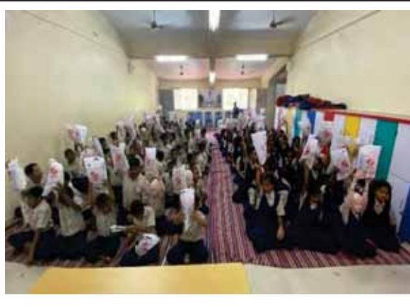
Certificate Distribution for NHFDC Skill Training for Disables