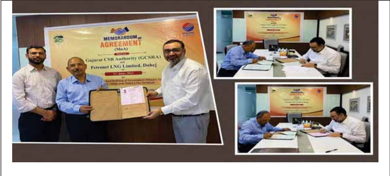
Safety Awareness at Luvara Village