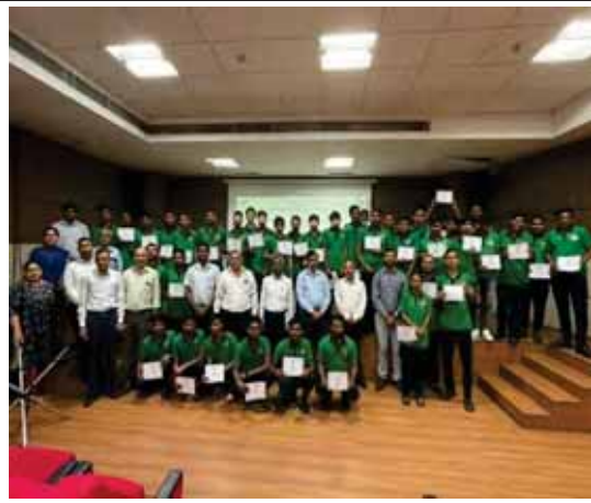
Mobile Health Unit (MHU) (Wockhardt Foundation)