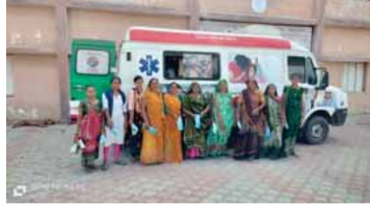
Ekal on Wheel, Ekal Gramothan Foundation