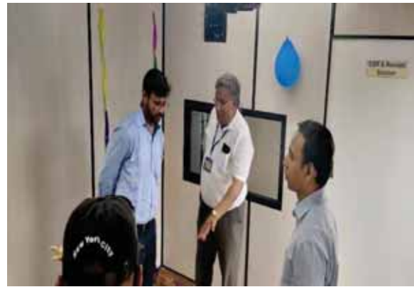
Visit of Ashmita Vikas Kendra, Tralsa