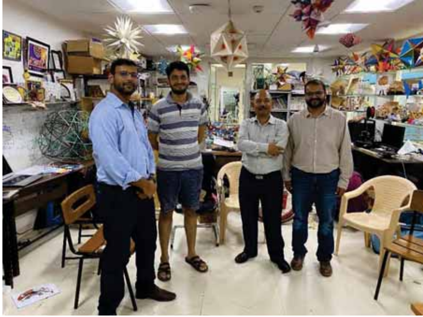
Skill Development Workshop on for promotion of Art & Culture