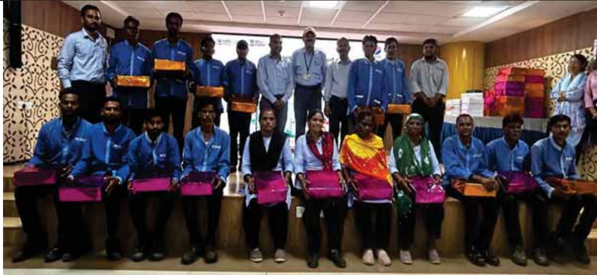
Kaushal Setu Skill Training – CIPET Ahmedabad, MOA Signed (P-IV)