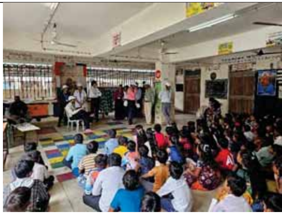
Redevelopment of Pond at Luvara Village