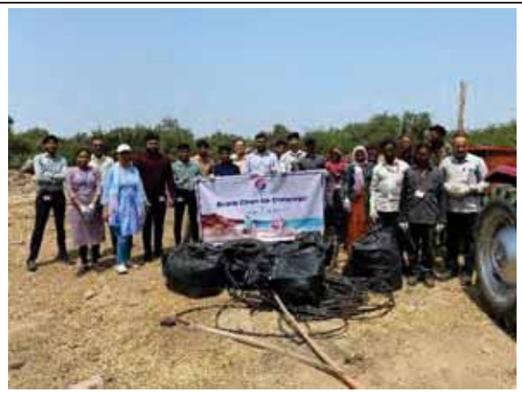
Beach Cleanup Drive 04.07.2024