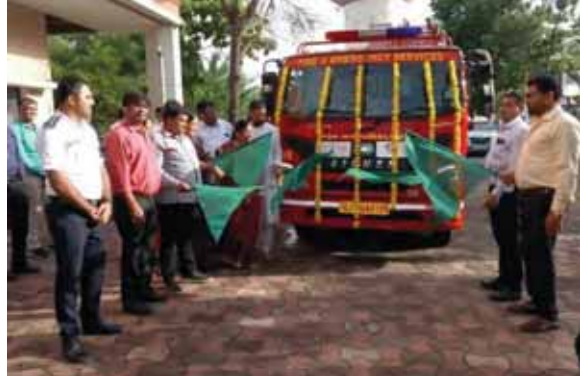
Visit of Seva Rural Jhagadiya