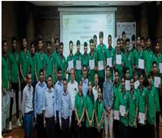
Mobile Health Unit (MHU) (Wockhardt Foundation)