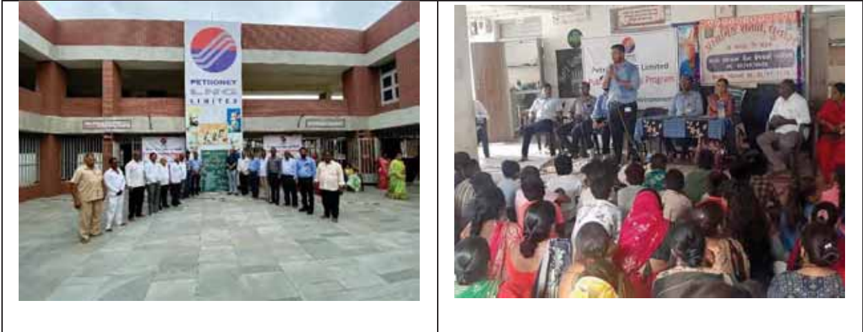
Redevelopment of Pond at Luvara Village