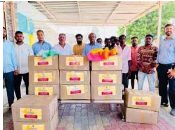
MoA for Construction of Govt. Primary School, Lakhigam Village