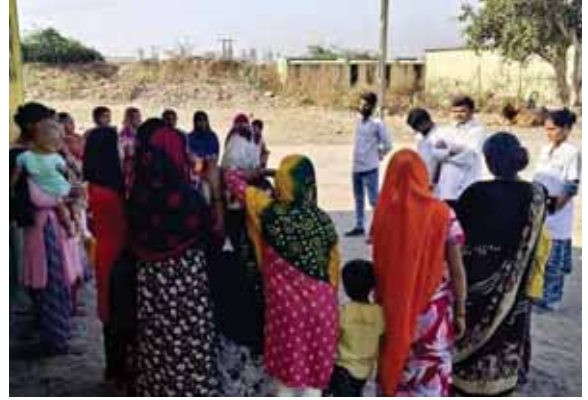
Celebration of World TB Day 2025