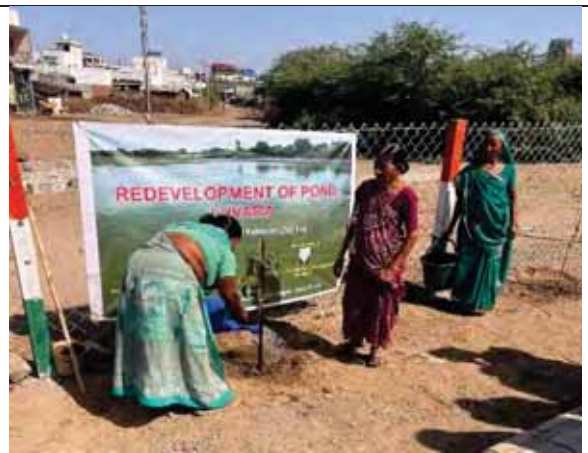
Health Awareness drive on Women's Day 2025