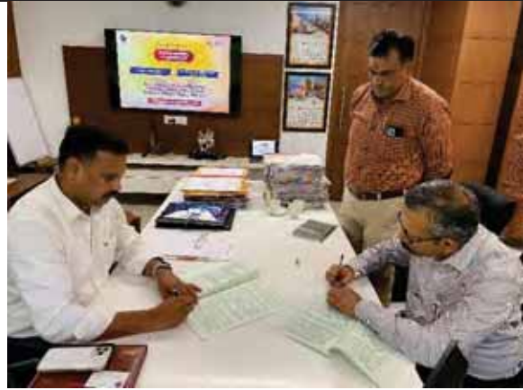
Support for Aid and Assistive Devices to Disables of Bharuch-Narmada District