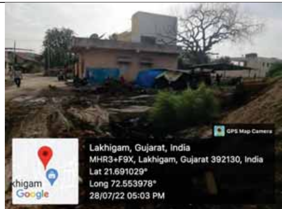
Visit of IIT-Gandhinagar