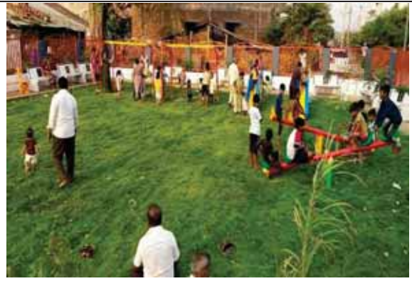
Support for Construction of School Building at Dahej (Multimedia Room and 2 No. of Classrooms)