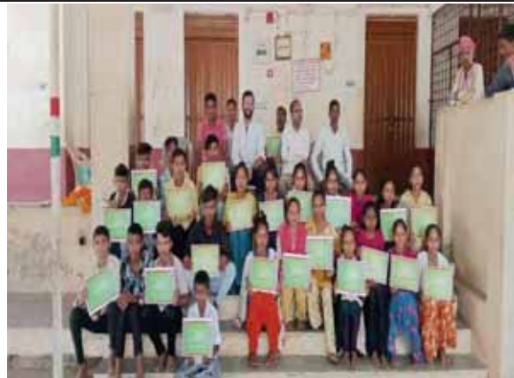
TB Mukat Bharat Abhiyan