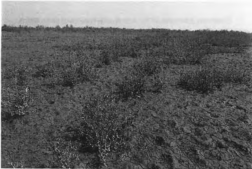
Mangroves planted in 200 ha. area at Bhavnagar Coast during 2014-15