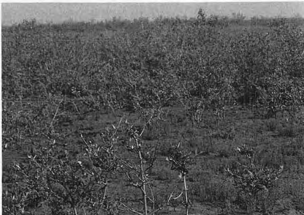
Mangroves planted in 200 ha. area at Bhavnagar Coast during 2013-14