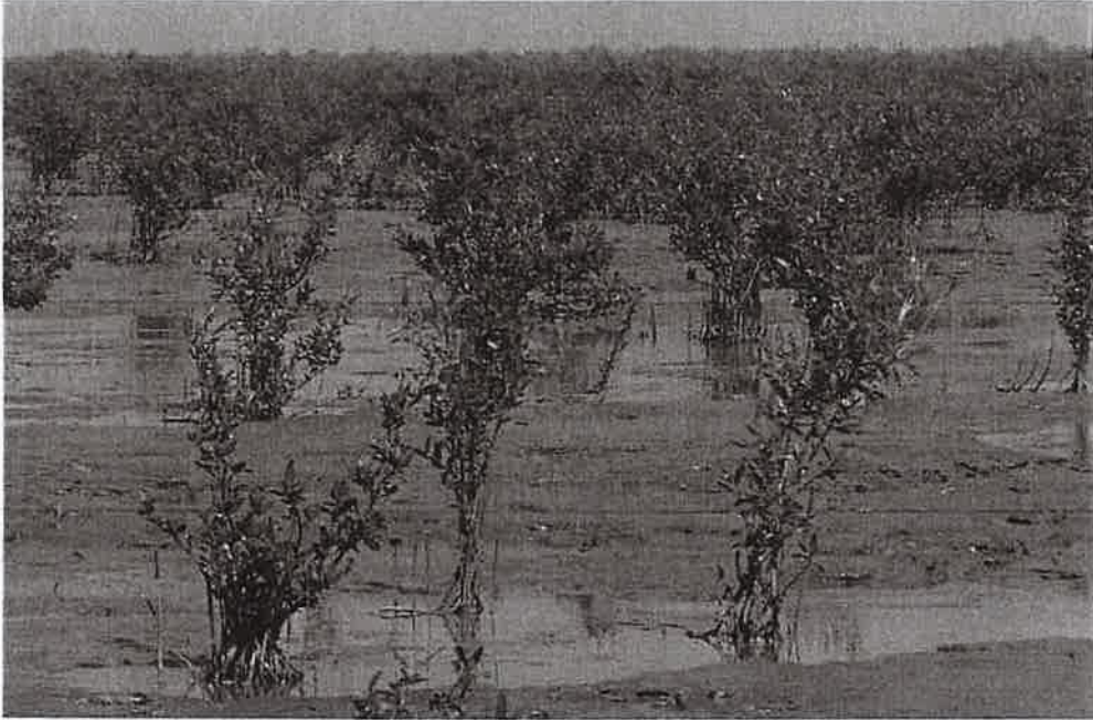
Mangroves planted in 50 ha. area at at Kentiyajal Coast during 2014-15